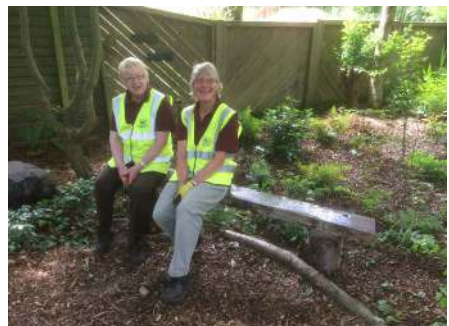
A new seat in the Maxell Garden