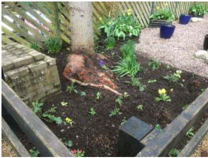
Newly planted corner