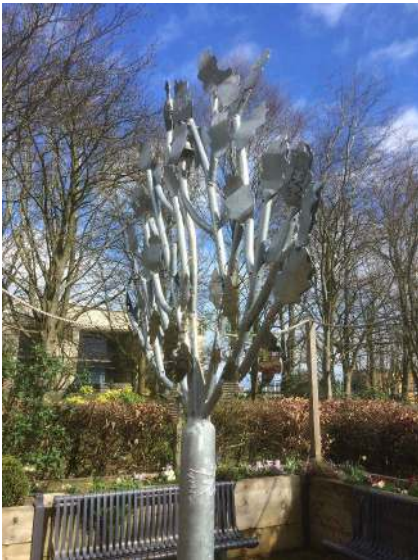
The Memory Leaf scheme with hanging leaves