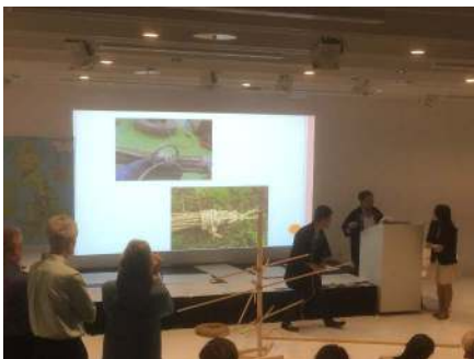
JGS Conference, London