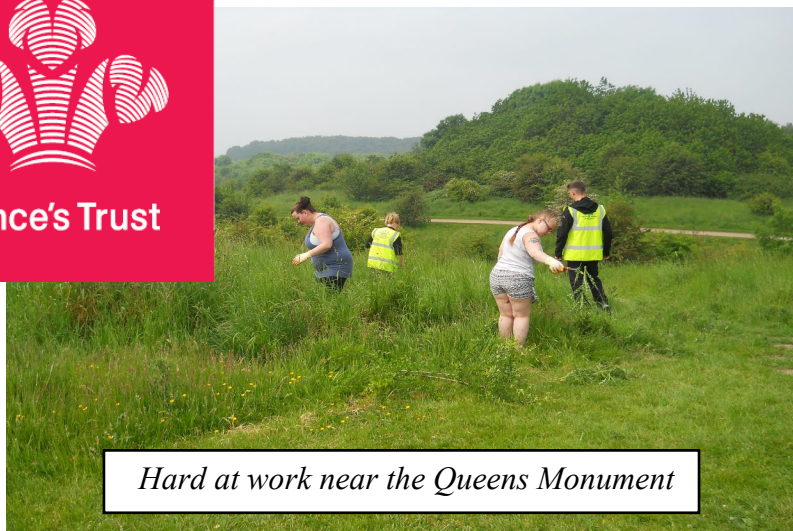
Hard at work near the Queens Monument

June saw 5 members of the local Princes Trust programme along with 3 of their leaders enjoying some scrub clearing in the park.